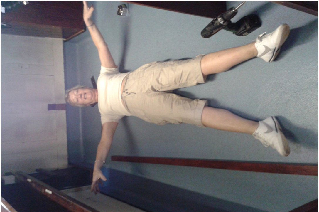
Our Bar Manager floored by the progress of the Bar Refurbishment... ...or is she just legless again? One way of making the front page though!