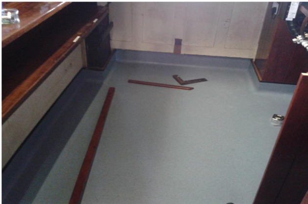
WOW what a difference.