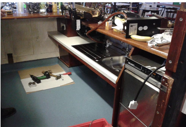
Now ready for Kev to start the pipework.