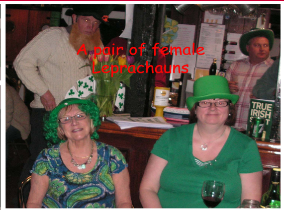
A pair of female Leprachauns