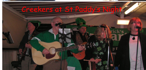
Creekers at St Paddy's Night