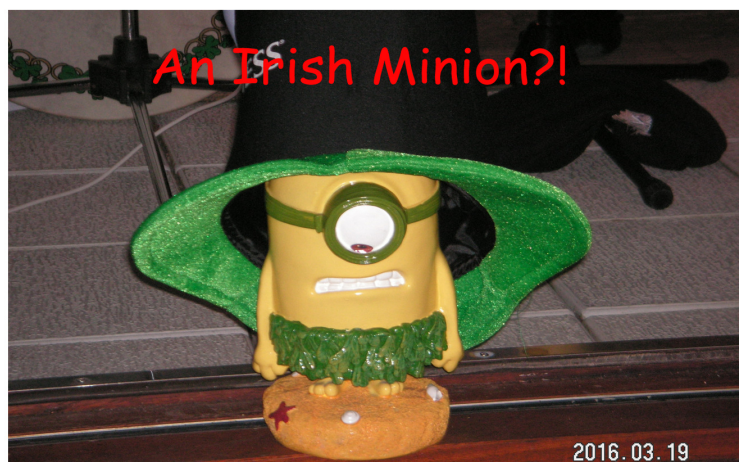
An Irish Minion?!