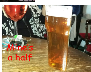
Mine's a half