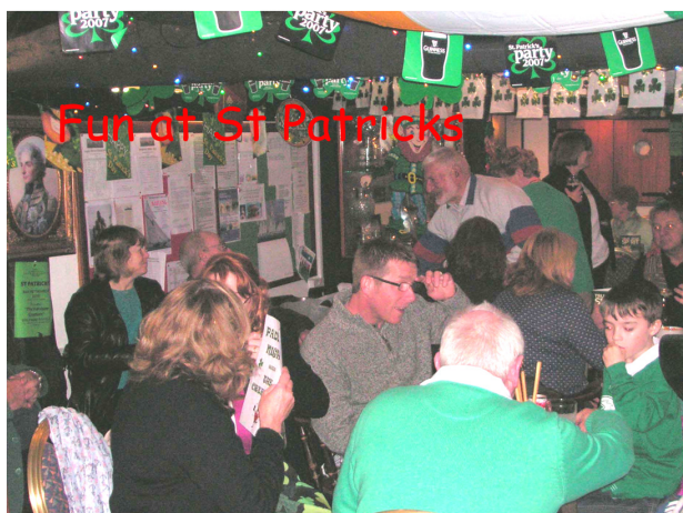
Fun at St Patricks