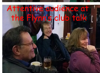
Attentive audience at the Flynn's club talk