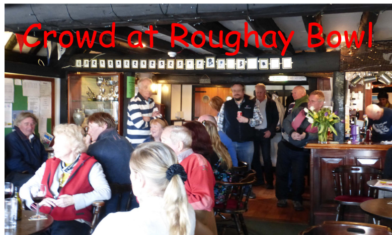
Crowd at Roughay Bowl