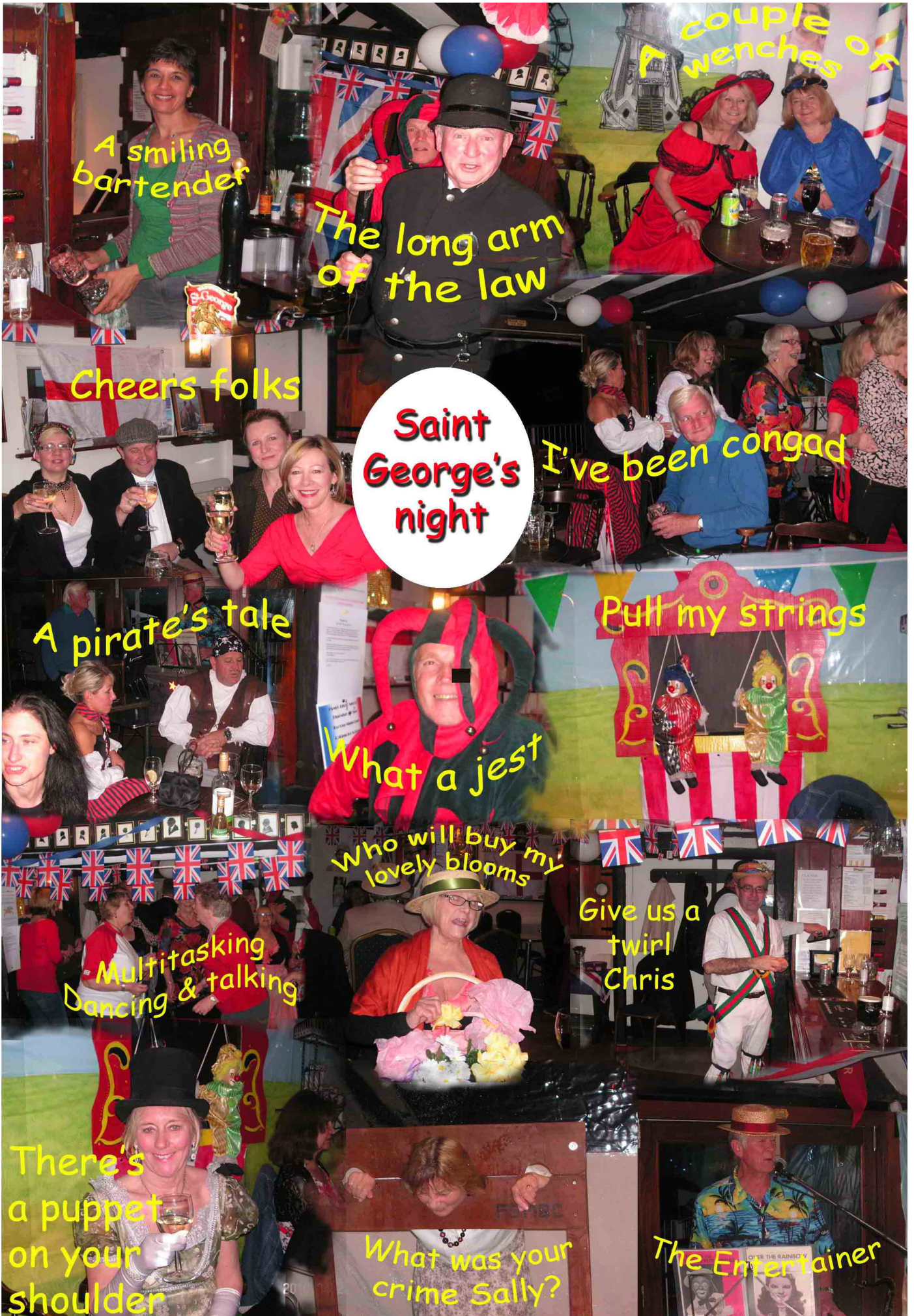
A smiling bartender