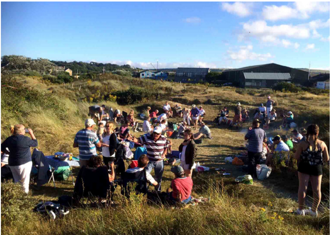
FSMBC members enjoy a BBQ at Bembridge