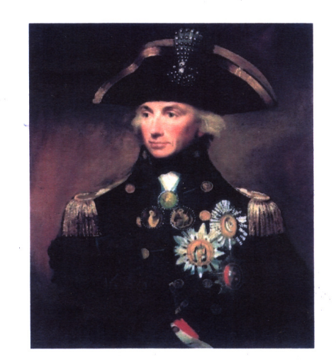
Saturday 22nd Oct 2016 at 7:30 Enjoy a three course meal, with wine and a tot of rum - Tickets £18.

Any items for inclusion in the Nov. edition to be emailed to publicity@fsmbcnet.org.uk by 20th of October.