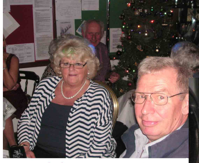
...and there was music ..