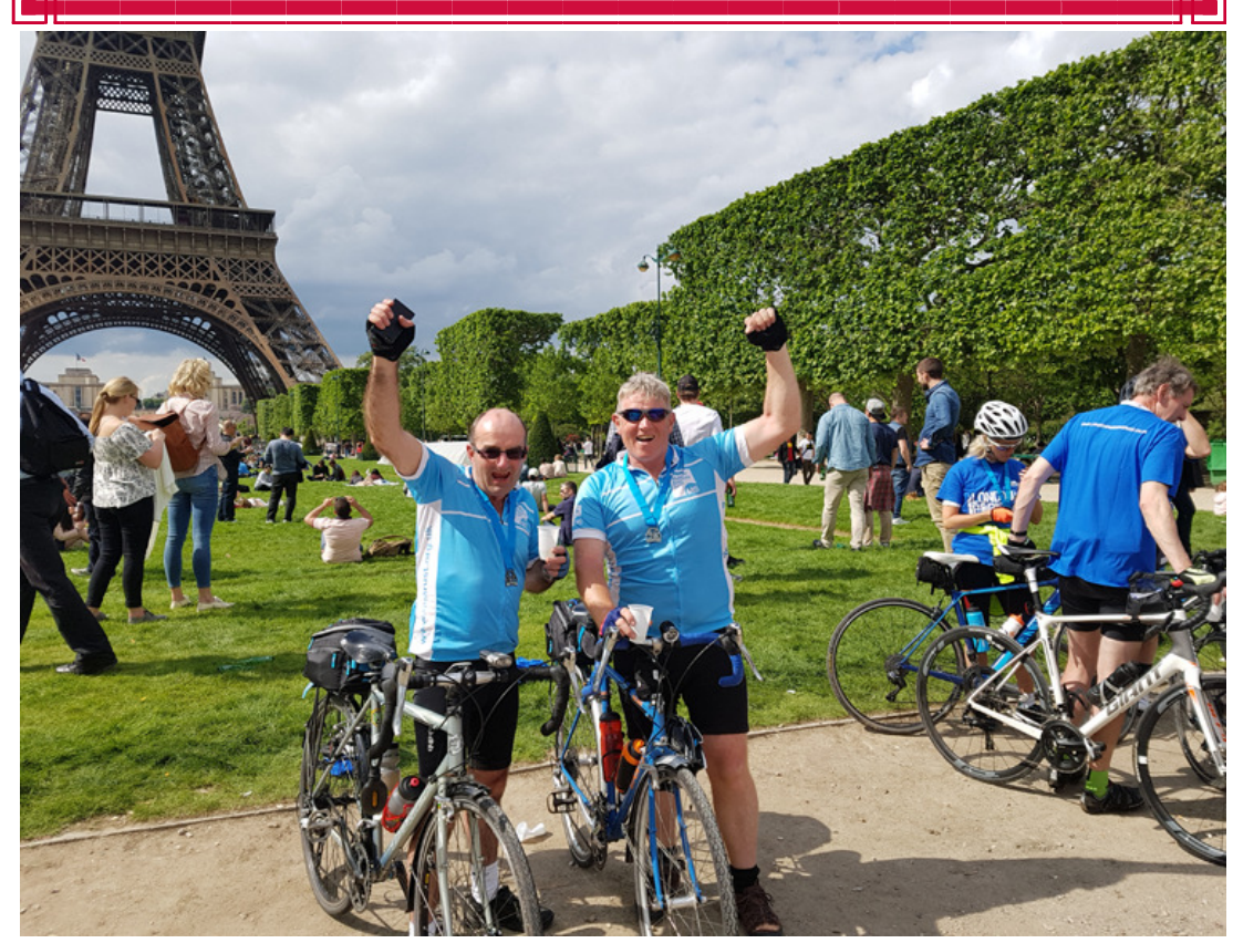
Well Done Lads!