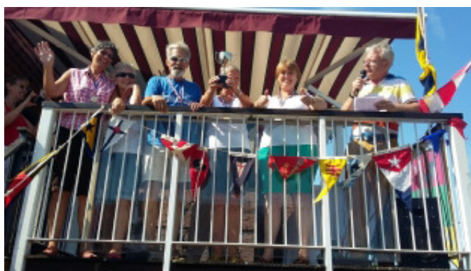
and the Regatta Cup crew.

An extra Gig event was, of course, in honour of the visit from our friends from Vannes.