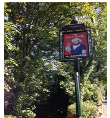
Right: Picture of Pub Sign just in case they can't find their way back there.