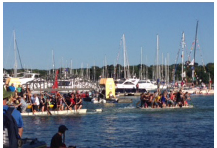
Above: Plenty of activity on the water.