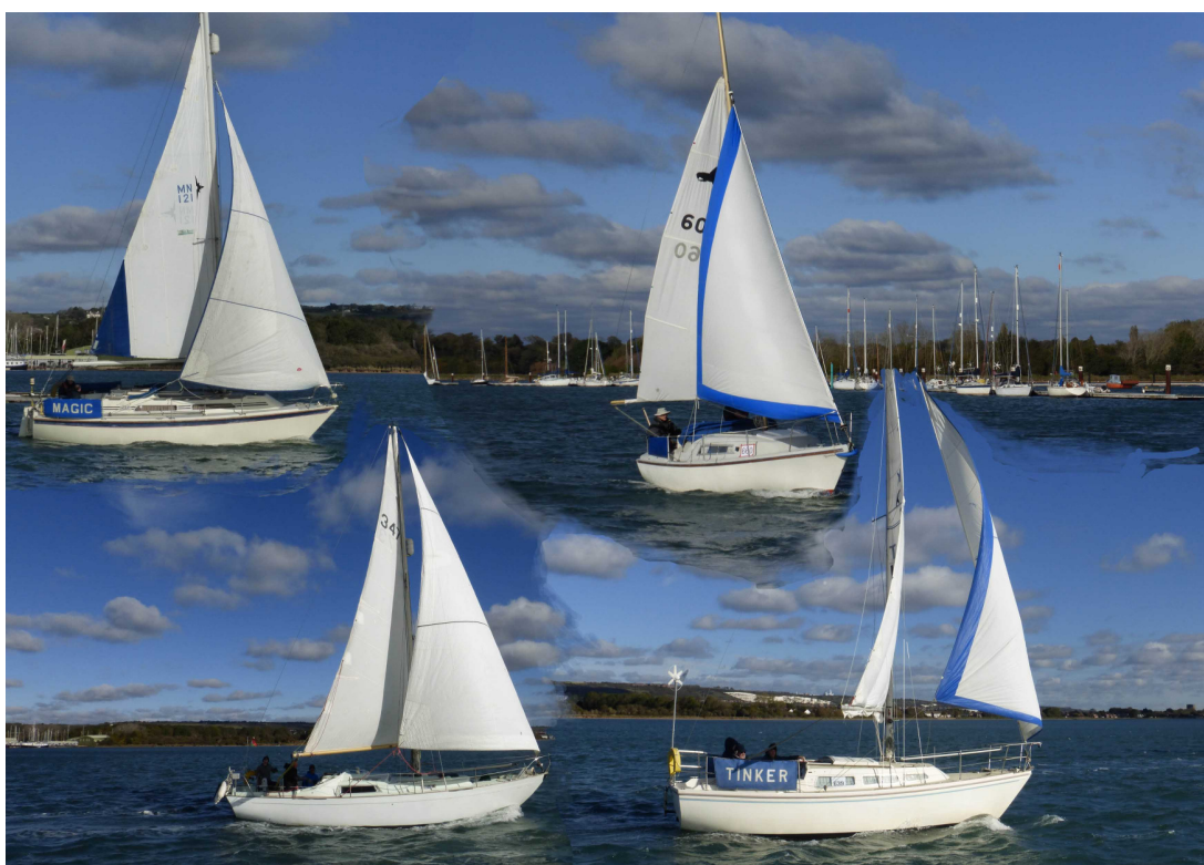
Cruiser Racing on a cold October day.