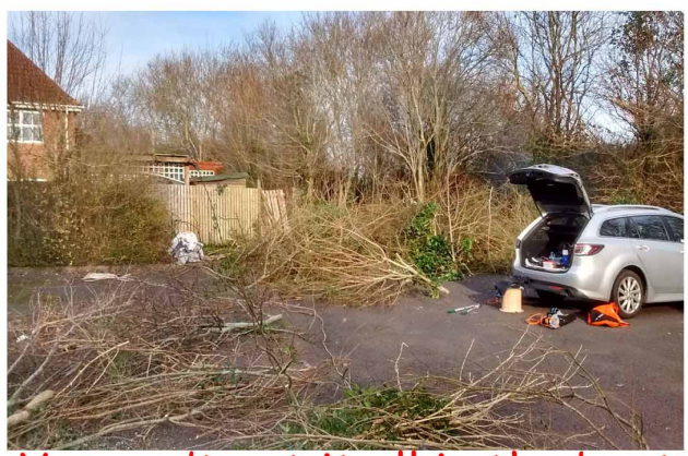
You can't get it all in the boot