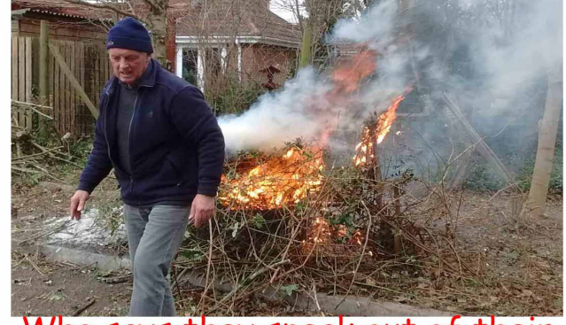
Who says they speak out of their flaming backsides?