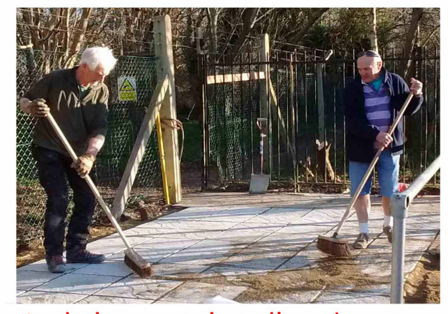
And they can handle a broom