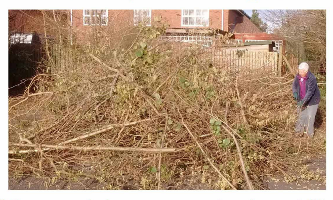
"Come and do some pruning he said!"