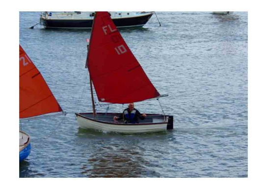
Enjoy a couple of hours sailing in company.