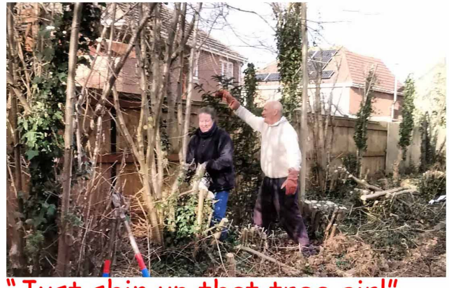
Just shin up that tree girl"