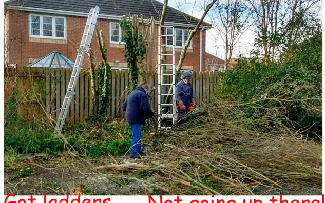
Got ladders ... Not going up there! They're held up by sky hooks?