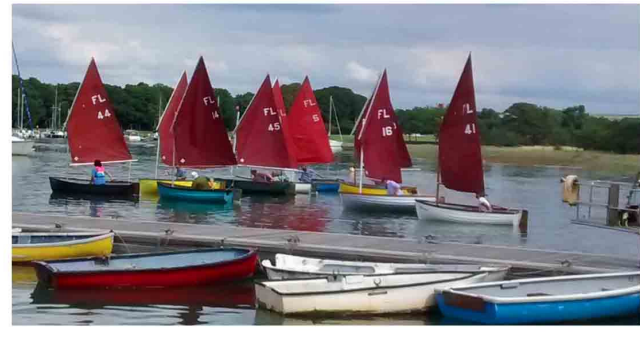
No great experience required

Just look at the schedule of dates, email me if you are interested and we'll get afloat.