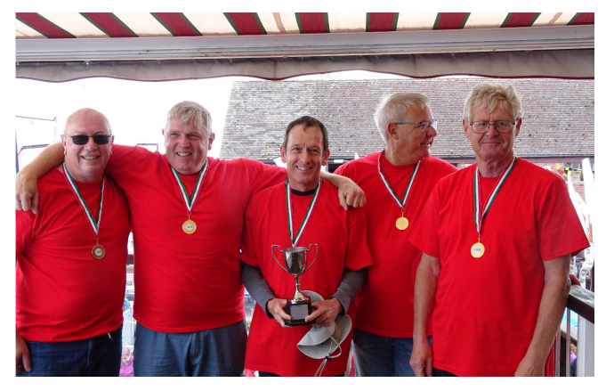
The Mayors Regatta Cup was won by the following lovely team: