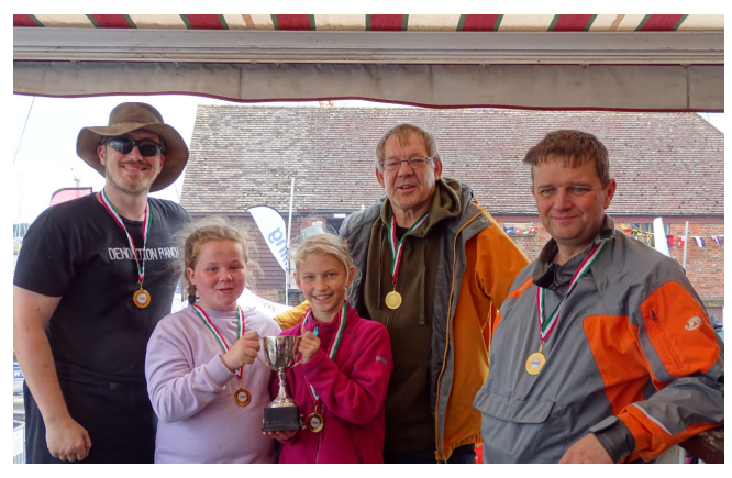
Another Fab Regatta and thanks to all who helped and came and participated - over 100 people took part over the weekend!!!