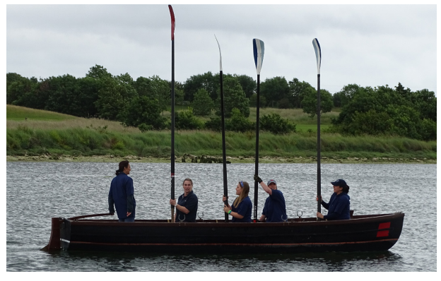
There were some intense races, Orange Men versus Grey Men

You're meant to stick them in the water!!